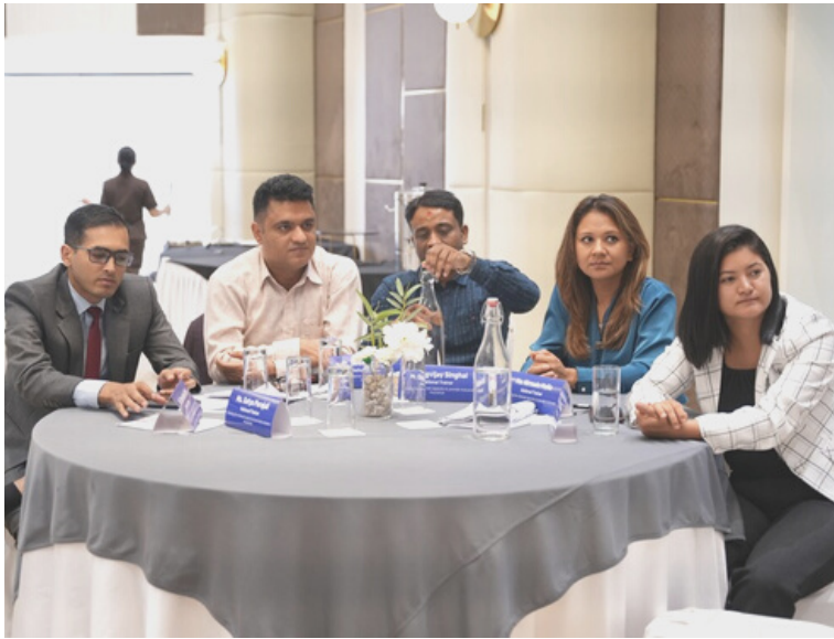
Bagmati, 4 th -8 th August