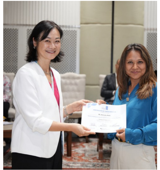
The program concluded with a certificate distribution ceremony led by Ms. Kyoko Yokosuka-Resident Representative, UNDP Nepal

As the insurance sector evolves, the training underscored a vital message: sustainable insurance is built not only on innovative products but also on trust, service, and lasting relationships. The program reaffirmed the shared commitment of IIN and UNDP to foster inclusive growth and resilience within Nepal's insurance ecosystem.