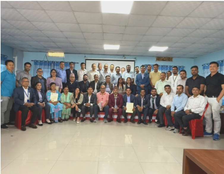
Koshi, 5th-6th September