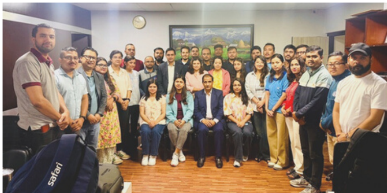
Bagmati, 3 rd - 8 th August