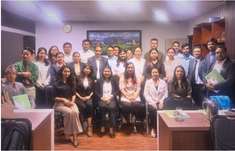
Bagmati, 24th-25th July