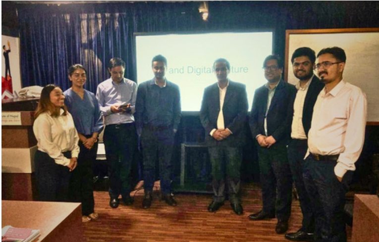
Bagmati, 30th July