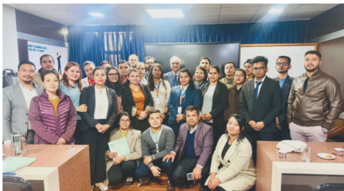
Bagmati Province, 21 st November 2025