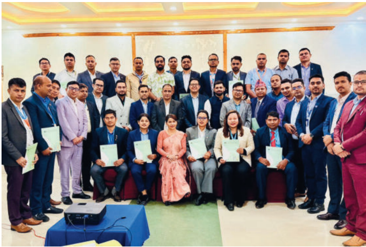
Lumbini Province, 7 th November 2025