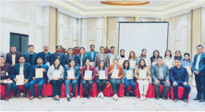
Bagmati Province, 19 th -20 th December 2025