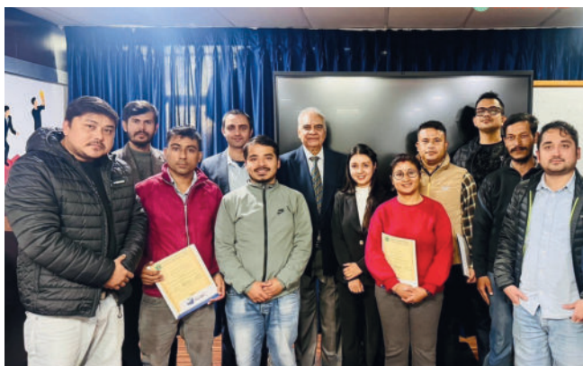
Bagmati Province, 20 th November 2025