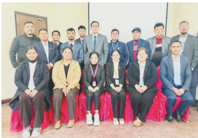
Bagmati Province, 7 th -12 th December 2025