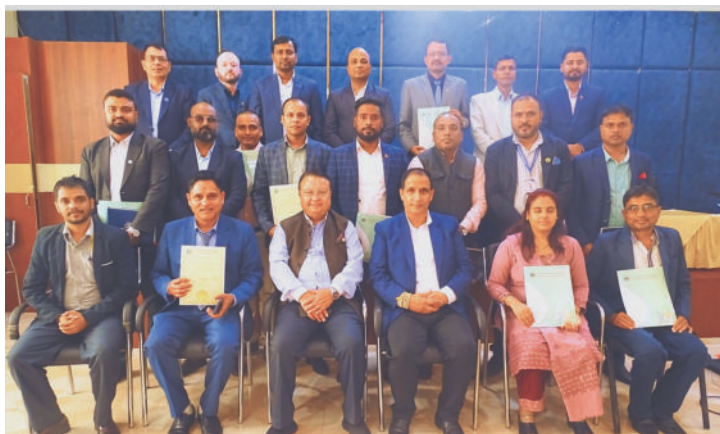
Madhesh Province, 21 st - 22 nd November 2025